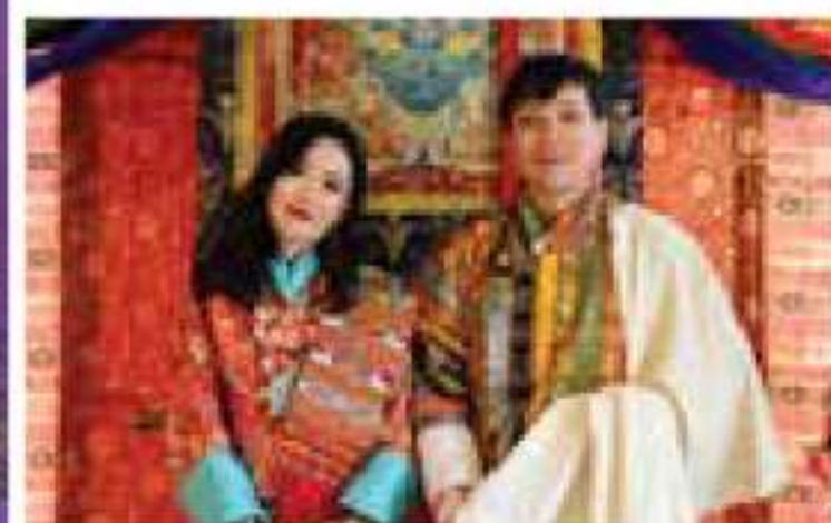
Bhutanese Costume Experience 不丹传统服装