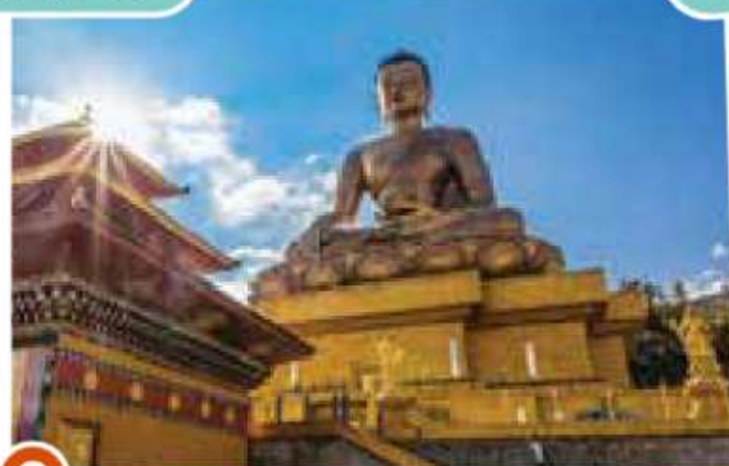
Bhudda Point 大佛点