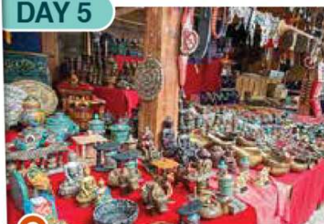
Paro Market 帕罗市场