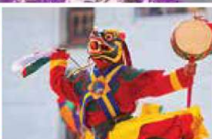
Bhutanese Cultural Dance 不丹文化舞蹈表演