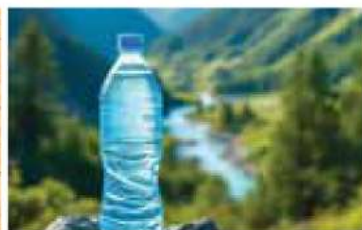
Unlimited Complimentary Water 无限矿泉水

蓝花楸树下的不丹 一场关于花、信仰与山谷色彩的旅程。 Nature and Faith in the Season of Blossoms.