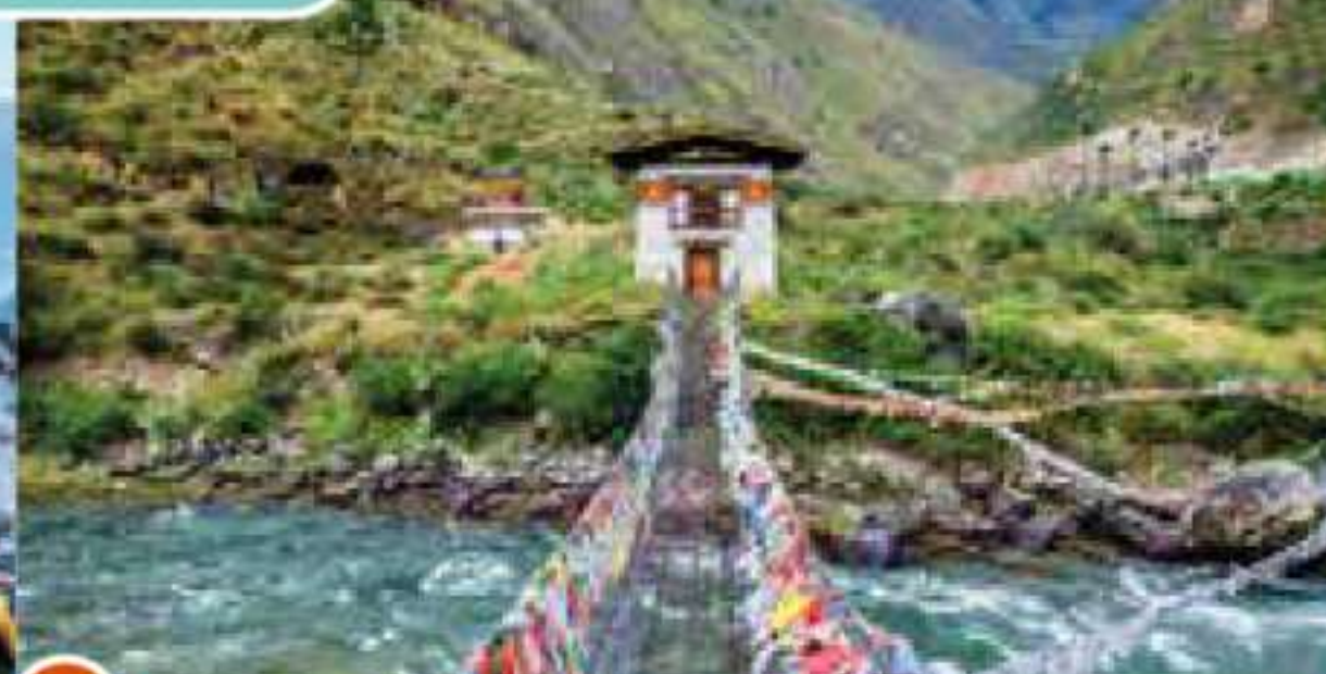
Suspension Bridge 悬索桥