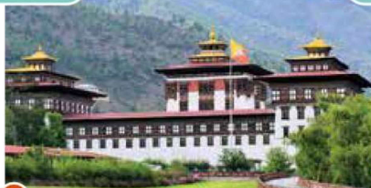
Tashichho Dzong 塔希乔宗