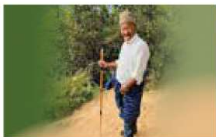
Hiking Stick at Tiger Nest 虎穴寺的登山杖