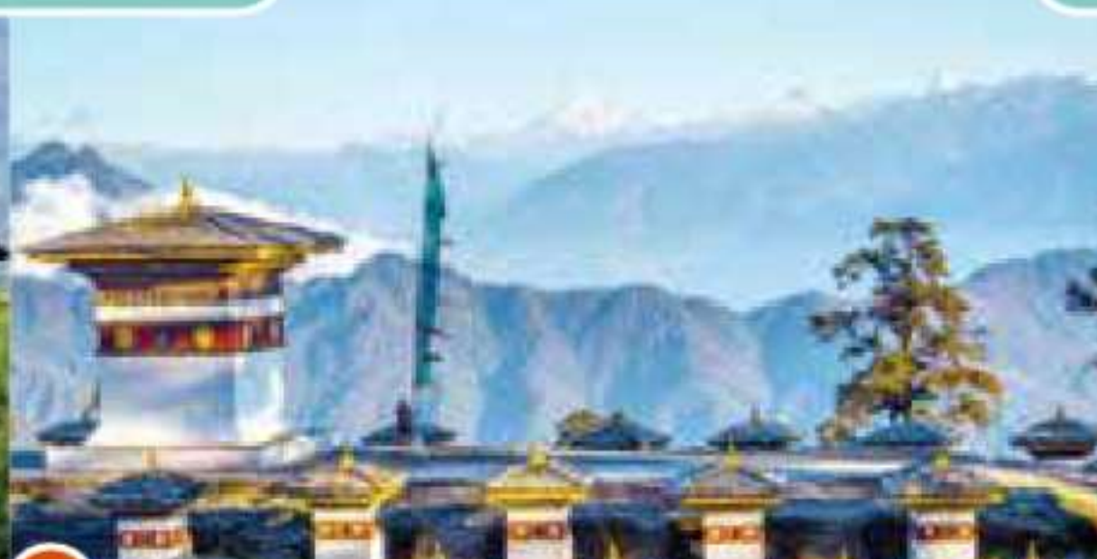
Dochula Pass 多楚拉山口