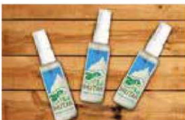
Organic Lemongrass Spray 天然香茅精油