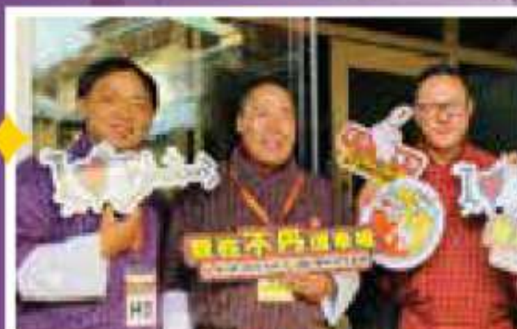
Chinese/English Speaking Guide 中/英文讲解团